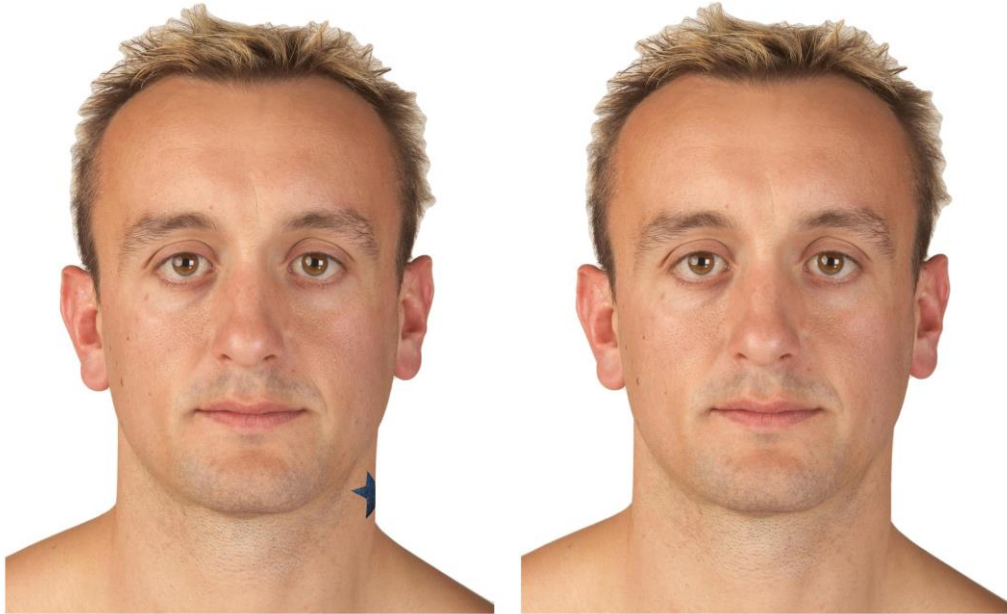
FIGURE 1: Example of a Tattooed Face (left) and Baseline Face (right)