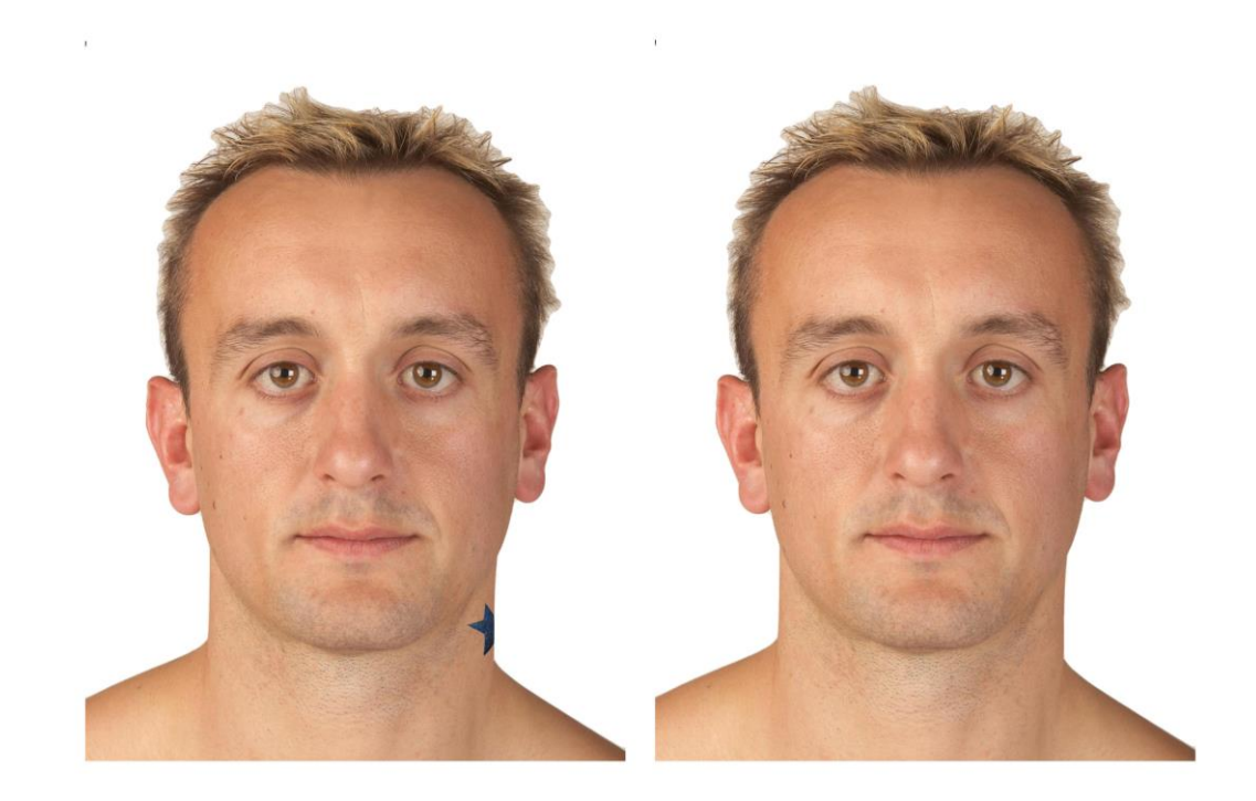
FIGURE 1: Example of a Tattooed Face (left) and Baseline Face (right)