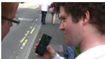
Figure 6: Study of mobile device notification co-management in collocated groups.

technology-enhanced social encounters really play out, in a multitude of settings including at work, at home, play, and travel. For example, in-depth ethnographic research has revealed the subtle and skilled ways in which we embed phone use in conversations in pubs (Figure 4) [19], living rooms (Figure 5) [20], and collaborative photo-taking (Figure 6) [6]. As Rooksby et al. [20] point out, “technology does not feature in the living room as something that brings or breaks intimacy, but rather mobile devices are things that enter an intimate environment and are used with respect to intimacy” (p.257).