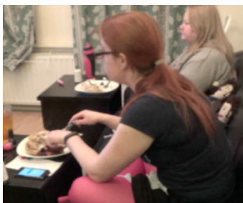
Figure 5: Work has captured the orderly use of how screens are used together in living rooms.