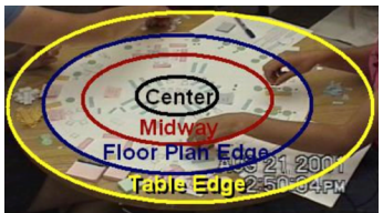
Figure 3: Work has identified territoriality in collaborative tabletop workspaces.