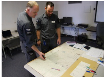
Figure 2: Analysis of orderly ways in which situational uncertainty is managed in disaster response.