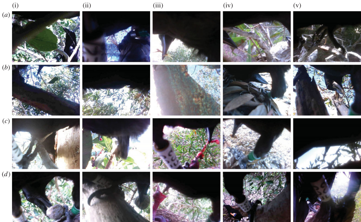
Figure 2. Still images from footage obtained with miniature video cameras attached to wild NC crows. For detailed image descriptions, see the electronic supplementary material, table S2. Panels c(ii) and d(iv) are reproduced with permission from [10].

duty-cycled solid-state loggers [10] has significantly improved our ability to collect uninterrupted recordings of behaviours of interest, which was key for achieving our principal study objective.