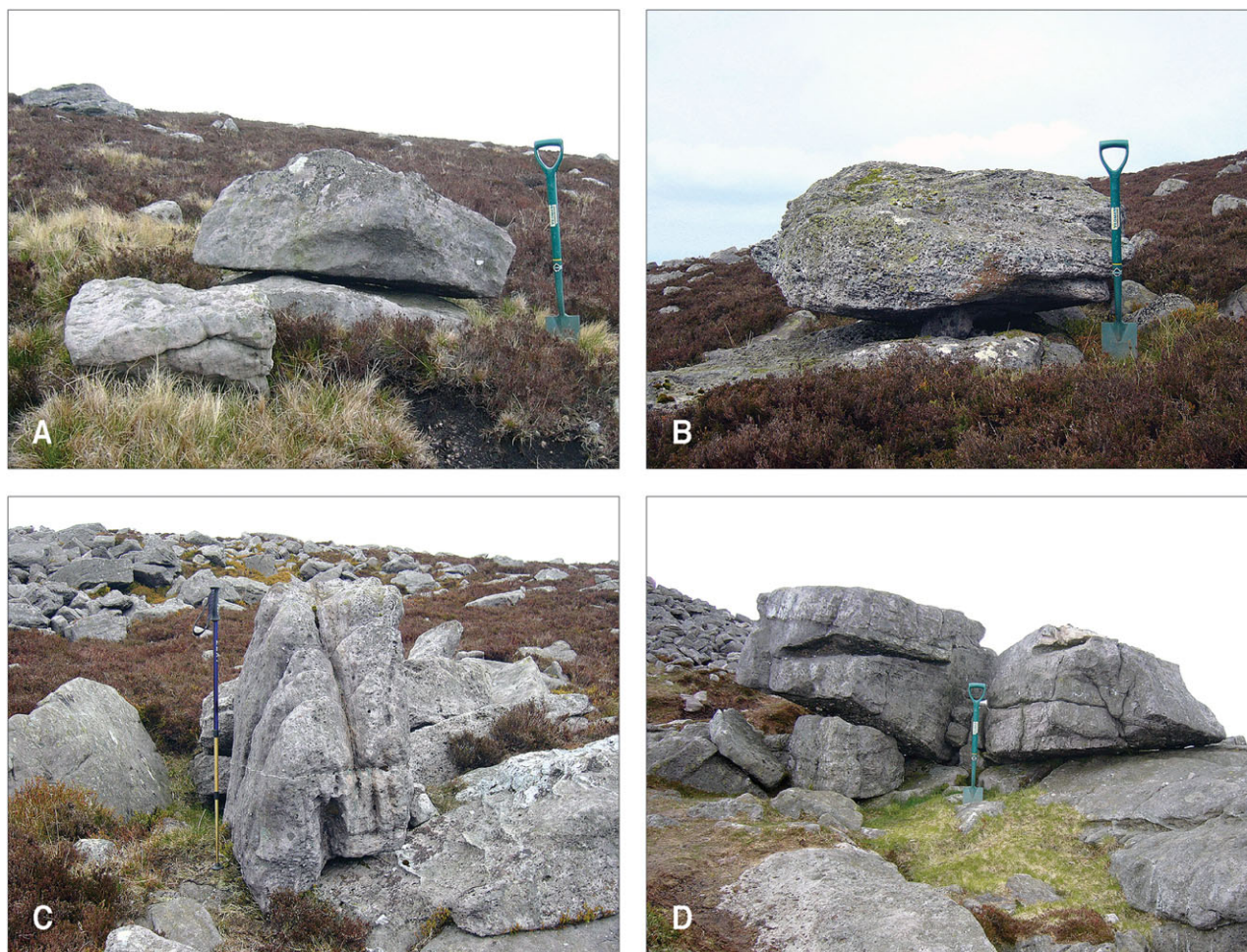
Fig. 3. Sampled sandstone perched boulders on Slievenamon. A. Boulder from which sample IRE-SE-18 was obtained. B. Boulder from which sample IRE-SE-19 was obtained. C. Upturned boulder from which sample IRE-SE-20 was obtained. D. Boulder from which sample IRE-SE-20 was obtained. The spade is 0.9 m long; the walking pole is 1.2 m long. This figure is available in colour at http://www.boreas.dk .

pied by a blockfield, although conspicuous perched boulders are absent (Fig. 2). Moreover, boulders derived from schist outcrops at 585–690 m a.s.l. SW of the summit occur only a short distance down-slope from their parent outcrops, suggesting no or limited glacial entrainment of debris from the summit area. Subdued granite outcrops at 535–560 m a.s.l. are inferred to represent glacially modified ‘tor plinths’, similar to those described by Hall & Phillips (2006) in the Cairngorm Mountains of Scotland, and below 460 m a.s.l. ice-moulded granite slabs supporting perched boulders are present.