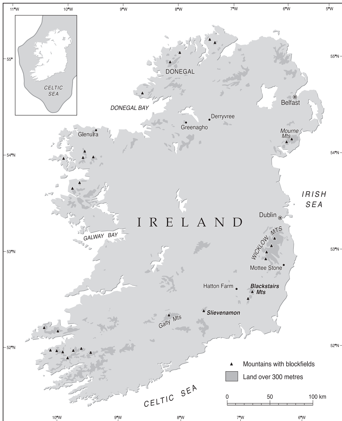
Fig. 1. Location of Slievenamon and Blackstairs Mountain and other locations mentioned in the text. The inset shows the lateral extent of the last Irish Ice Sheet as inferred by Sejrup et al. (2005).

rock–substrate interface exceeded basal shear stress (Kleman & Glasser 2007), permitting the survival of blockfields and frost-shattered bedrock outcrops throughout the last glacial cycle. This interpretation implies that trimlines define the minimum rather than maximum altitude of former ice cover during the LGM.