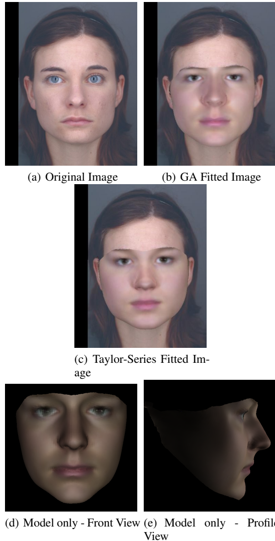
Figure 3: Example results from the face fitting algorithms. The top-left image shows the target face image for one of the subjects. The top right image is the result of the Genetic Algorithm applied to the target image. The middle row shows the results of fitting using the Taylor-Series algorithm for comparison. On the bottom row the models produced by the Genetic Algorithm are shown in both full-face (left) and profile (right) views.