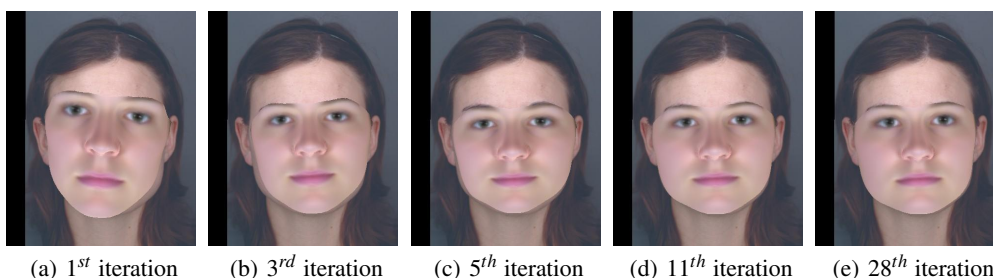
Figure 2: The progress of the Genetic Algorithm in fitting to an example face. Each image shows the best sample from the indicated iteration.

The algorithm described offers a clear improvement over the simple Taylor-Series method. The Genetic Algorithm is able to reasonably accurately estimate the shape of the face without guidance by feature landmarks or other form of initialization. We believe this offers a significant improvement over current techniques as the method can be applied easily to large data-sets. One drawback of the algorithm that is worth mentioning is the speed. The average time taken for each subject in our set was 18.4 minutes on a 2.4GHz Intel(R) Core(TM)2 CPU. Gradient descent methods are significantly faster, taking an average of 4.7 minutes each. Although slower our method is more accurate than the Taylor-Series method. The standard deviation of the errors is significantly larger for the Taylor-Series method as this method produces highly inaccurate fits in a number of cases, whereas the GA method is more consistent.