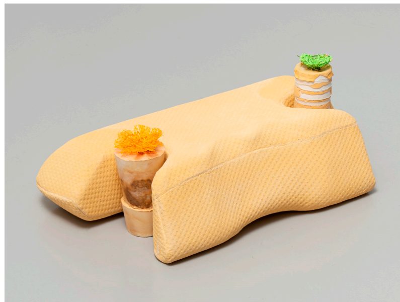
Figure 3. Veronica Ryan, Infection III , 2020, plaster, paper netting, cast of CPAP medical cushion. Copyright Veronica Ryan. Courtesy of the artist, Alison Jacques, London and Paula Cooper Gallery, New York.

Within the formal and material vocabularies that Ryan has developed since her career as a sculptor began in the 1980s, some of the most immediate explorations of care manifest in references to, and uses of, pillows. Several sculptures in Infection incorporate medical pillows, as did other works in Along a Spectrum , including for example an eye-popping hot fuchsia cushion shaped like a double donut which hung from the wall. The main section of Infection III (2020) consists of a yellow CPAP pillow, a rigid rectangular shape with two semi-circular holes cut into either end (Figure 3). These holes provide space for the mask and tube sometimes diagnosed for sufferers of sleep apnea, which regulates their breathing through the night. Designed for propping and supporting the body—by implication the body in pain or discomfort, or in need of rest—the pillows link to the infrastructure of the care industry which Vergès, Fraser, and others have highlighted as an acute site of the contemporary care crisis, exemplifying how devalued care work is gendered and racialized (Vergès [2019] 2021, p. 78).