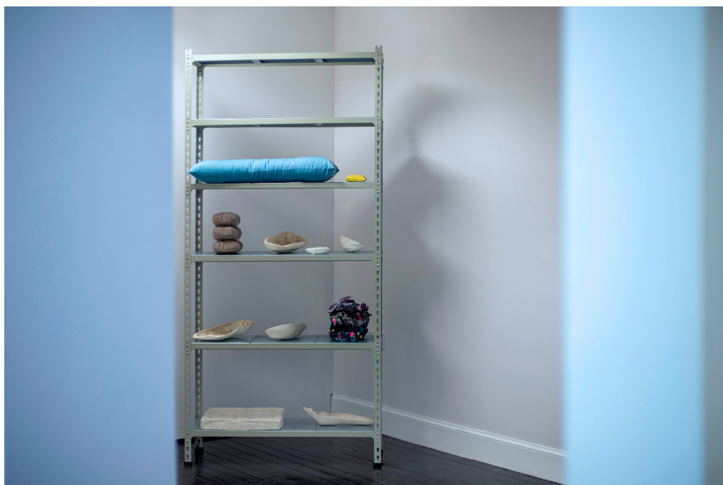
Figure 10. Veronica Ryan, Particles , 2017, mixed media, 198 × 91.5 × 30.5 cm. Commissioned by The Hepworth Wakefield in partnership with The Art House, Wakefield, 2017. Copyright Veronica Ryan. Courtesy of Wakefield Council Permanent Art Collection (The Hepworth Wakefield). On display at Glasgow Women's Library, as part of Life Support: Forms of Care in Art and Activism , 2021. Photo credit: Neil Hanna.

institutional curatorial care, particularly regarding the practical issues of lighting, temperature, and humidity levels, and our desire to present the sculpture in an accessible way within a library as opposed to a gallery, a space deliberately designed and operated as a resource for multiple individuals and groups (Figure 10) (Gausden et al. 2023). Many of the curators and scholars cited at the beginning of this essay have highlighted the danger that care in curating is employed in a tokenistic way, merely as terminology, rather than as an ethics that demands attentiveness to structural imbalances of power within institutions, including modes of display (Reckitt 2020, p. 196; Vergès 2023). These are precisely the considerations, however, that Ryan catalyzes through materials and form. Ryan's sculptures challenge a straightforward definition of curating with care as turning attention towards people rather than objects, reminding curators and viewers alike that our subjectivities and embodied experiences are often deeply cathected to objects, in ways that are important to both our internal and interpersonal lives.