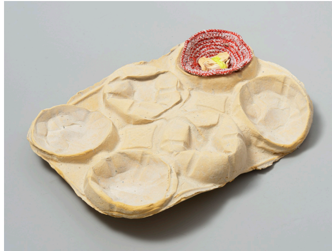
Figure 2. Veronica Ryan, Infection XVII , 2020, plaster and thread.

'Bleecker Street has a lot of shops and restaurants with kitchenware and stainless steel and lots of cake stands and little cake containers, and it was really exciting collecting those objects' (Ryan 2000, p. 4). Yet the stark contrast between the stainless-steel food containers that attracted Ryan in the early 1990s and the battered, bathetic form of Infection XVII is instructive. The plaster cast has captured every dent in the friable plastic, conveying a sense that whatever it housed has been consumed or discarded along with the packaging itself. In one of the sections nestles a small circle of textile, stitched using bands of red and pinkish thread, which in turn cradles fragments bound together with yellow twine, suggesting an attempt to patch a hole or tear.