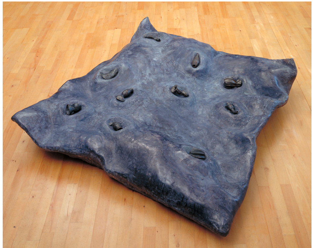
Figure 6. Veronica Ryan, Relics in the Pillow of Dreams , 1985, plaster and bronze, 300 × 1540 × 1540 mm. Copyright Veronica Ryan. Tate, presented by Charles Saatchi 1992.

zone, a time between sleeping and waking when the mind's associative and creative powers were thought by Freud to be at their most acute.