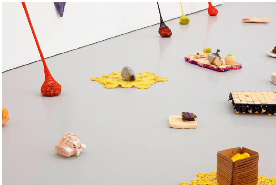
Figure 1. Veronica Ryan, Infection (2020–2021) (detail), bronze, plaster, paper, plastic net, seeds, other materials, dimensions variable. Commissioned by Spike Island, Bristol and supported by Freelands Foundation. Copyright Veronica Ryan.

‘biological’, and ‘mass produced’. The material references of the sculptures gathered in Infection initiated a constant oscillation between association and dissociation, recognition and confusion, but while their arrangement and intent remained oblique, the multiform elements of the work were bound together by dynamics of care.