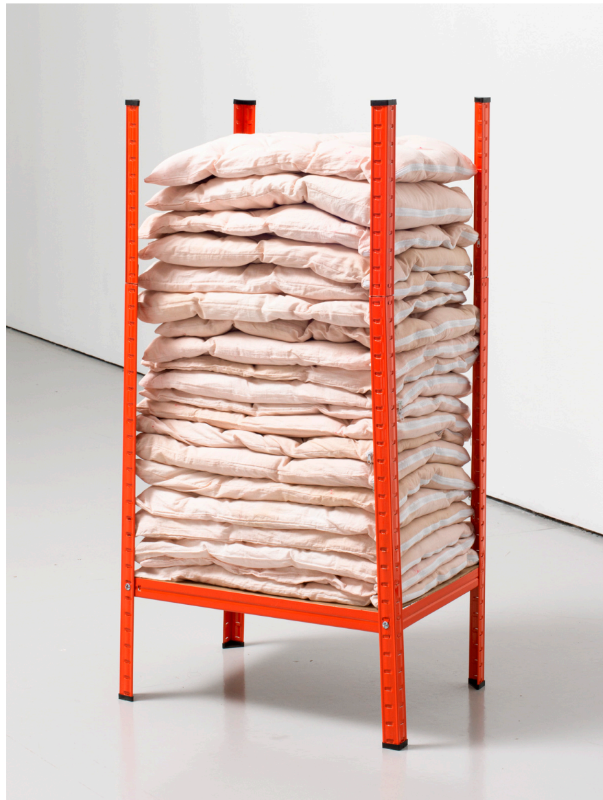
Figure 4. Veronica Ryan. Protectors , 2017. Copyright Veronica Ryan.

ions, and padding grew through this project, which provided the opportunity to unite key themes from her practice, while developing new aspects of her thinking about pillow forms (Ryan 2017b). During the Art House residency, Ryan became particularly interested 'in the way that pillows have this medical function for cervical, spinal problems and different kinds of pillows are used for different parts of the body' (Ryan 2017a). Large, rectangular pillow forms proliferated in the final exhibition, entitled Salvage , stacked inside an upright, medical-looking metal armature for Protectors (2017) (Figure 4); tie-dyed and piled on top of each other in a soft geological mass in Layered, Strata (2017); and scattered in a fallen heap for Grey Matter (2017) (Figure 5). Smaller pillow shapes also appeared in the large-scale sculpture Particles , co-commissioned by Hepworth Wakefield and displayed at the museum in conjunction with Salvage , and in works that alluded to the sculptural precedents of Barbara Hepworth and Louise Bourgeois.