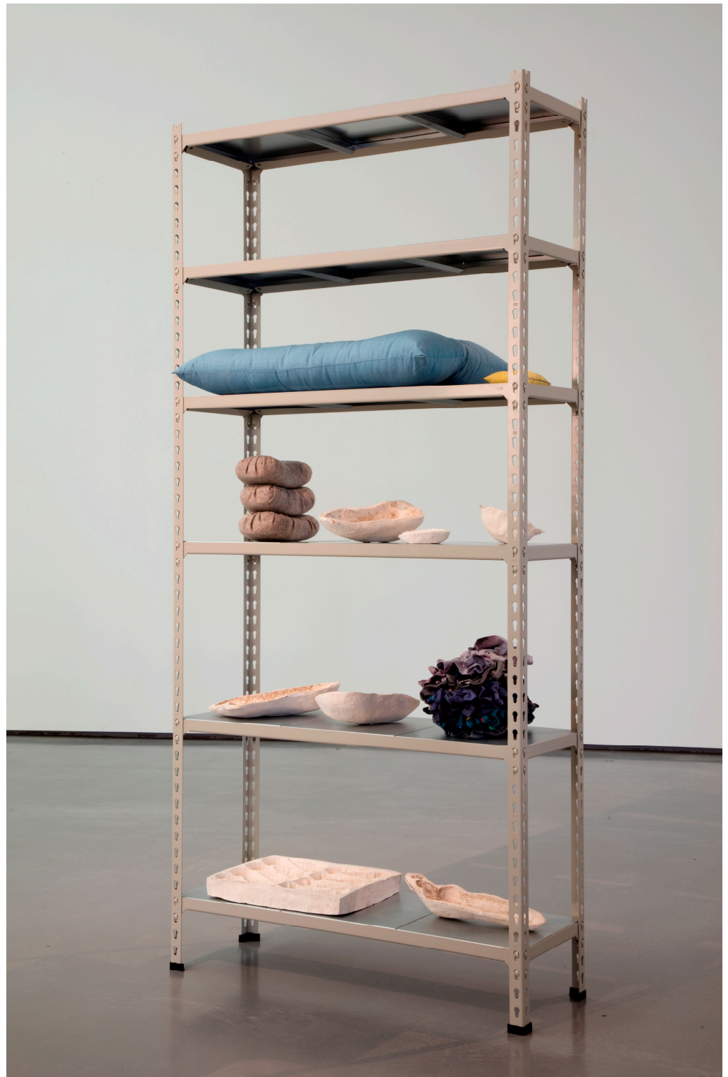
Figure 9. Veronica Ryan, Particles , 2017, mixed media, 198 × 91.5 × 30.5 cm. Commissioned by The Hepworth Wakefield in partnership with The Art House, Wakefield, 2017. Copyright Veronica Ryan. Courtesy of Wakefield Council Permanent Art Collection (The Hepworth Wakefield).

The experience of displaying Particles highlighted the contradictory forms of care often operative at any one time within the curatorial context. As a curatorial team, we have reflected together on the ultimately unreconcilable tension between the requirements of