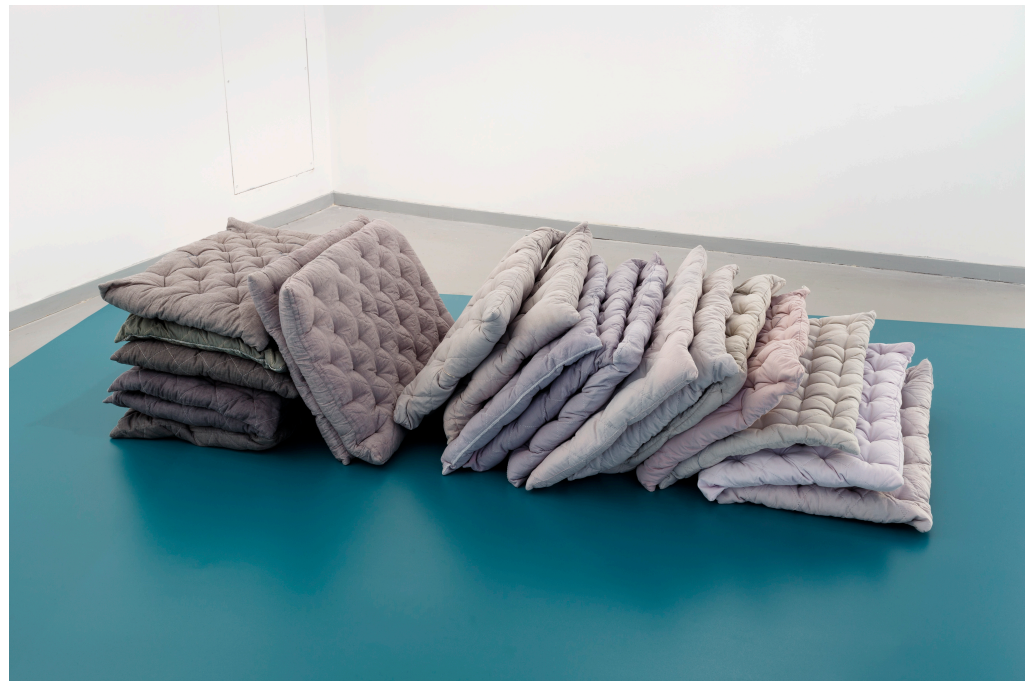
Figure 5. Veronica Ryan. Grey Matter , 2017. Copyright Veronica Ryan. Courtesy of The Art House, Wakefield. Photograph: Jules Lister.