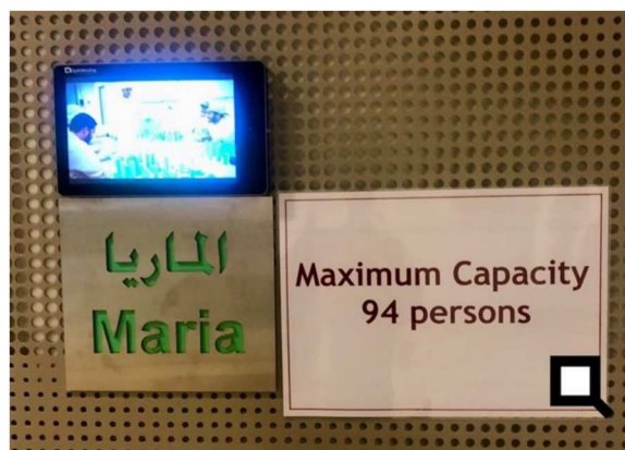
Figure 3. Bilingual sign in an EMI UAE university, where English dominates.

A second significant strand to emerge from Dialogue 2 was the hiring of ‘native speaker’ teachers and US and UK-centric material used in EMI classrooms, as seen in Extract 5.