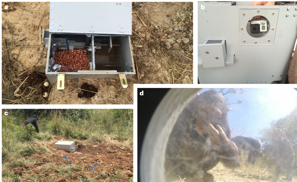
Fig. 1 | Experimental setup during the baseline phase. a–d, The apparatus (a,b) was introduced in the enclosures of Groups 1 and 2, after which the chimpanzees inspected and attempted to solve it (c,d). The apparatus worked with a drawer mechanism (b) that the chimpanzees needed to pull out to uncover the hole in the drawer, in which they needed to insert a wooden ball (Supplementary Video 1). If they were successful, they automatically received a food reward owing to the

workings of an electric food-dispensing mechanism inside the apparatus. The blue arrows in c indicate the locations of balls needed for the drawer. Image d was extracted from the motion-sensitive camera that was built into the apparatus to capture any attempts made by the chimpanzees throughout the day and even during dusk and dawn. At no point during the baseline phase was a chimpanzee successful at operating the apparatus.