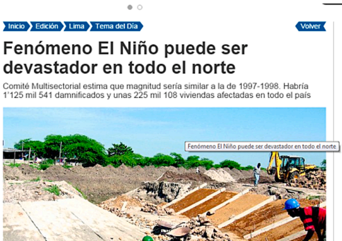
Fig. 1. Pre-emptive media coverage predicting a large-scale El Niño event in 2016.

Globally, new initiatives are increasingly seeking to acknowledge children's unique capacities, improve their access to resources (Skelton and Aitken, 2019) and work towards a "culture of risk reduction" (Peek, 2008:13). Such approaches reflect and enact epistemological commitments in the field of children's geographies. For example, strategies focus on generating spaces for cognitive processing and emotional recovery (Akhter et al., 2015; Izadkhah and Gibbs, 2015) and streamlining children's rights in policy arenas (Muzenda-Mudavanhu, 2016). Other approaches seek to empower children as risk communicators (Mitchell et al., 2008) and advance reconstruction and livelihood stability (Peek,