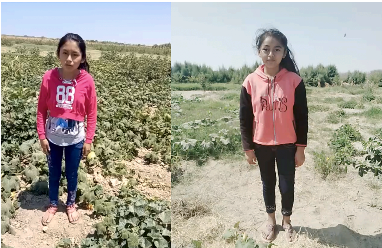
Fig. 3. Students in the videos they created, describing the agricultural landscape in the face of El Niño events. (Left: pumpkin, right: beans).