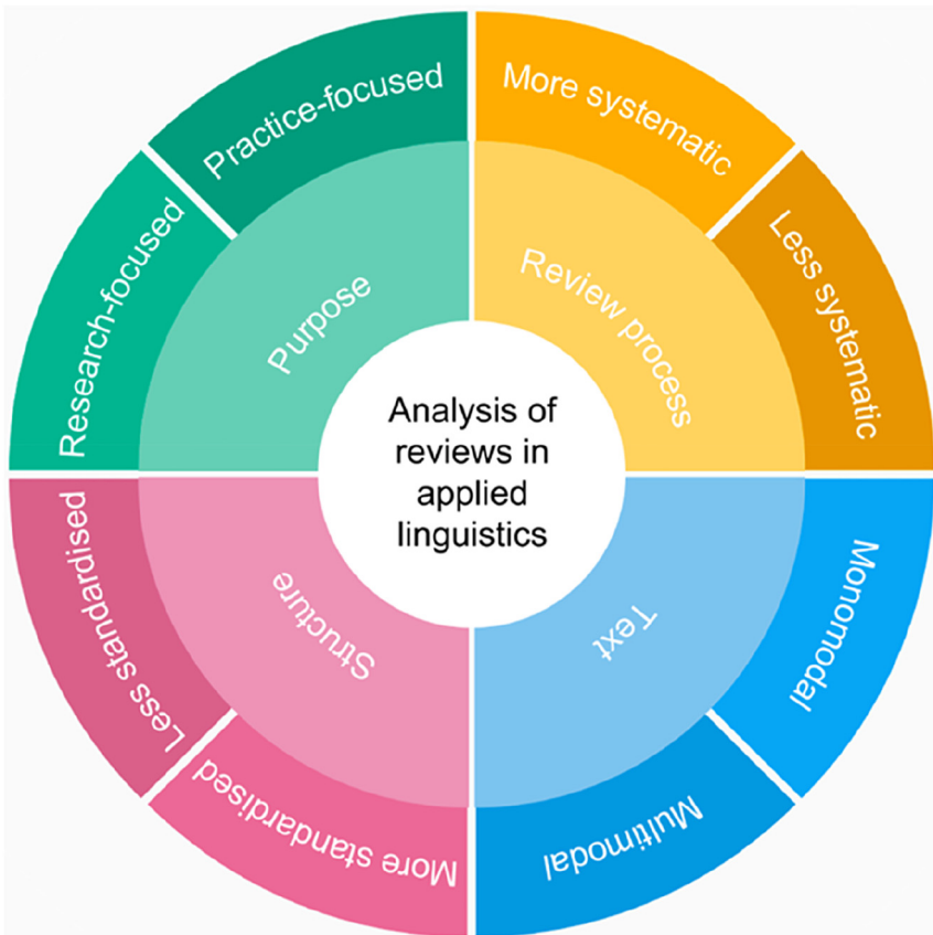
Figure 2: Four areas for analyzing secondary research in applied linguistics.

Having laid out the 13 types of secondary research being employed in Applied Linguistics, we now turn to four dimensions, or continua, that characterize and distinguish between them. These include (a) research versus practice; (b) more versus less systematic; (c) more versus less structured presentation; and (d) multi-versus mono-modal (see Figure 2). We note that new continua and ways of describing secondary research many be needed as new types of secondary research emerge.