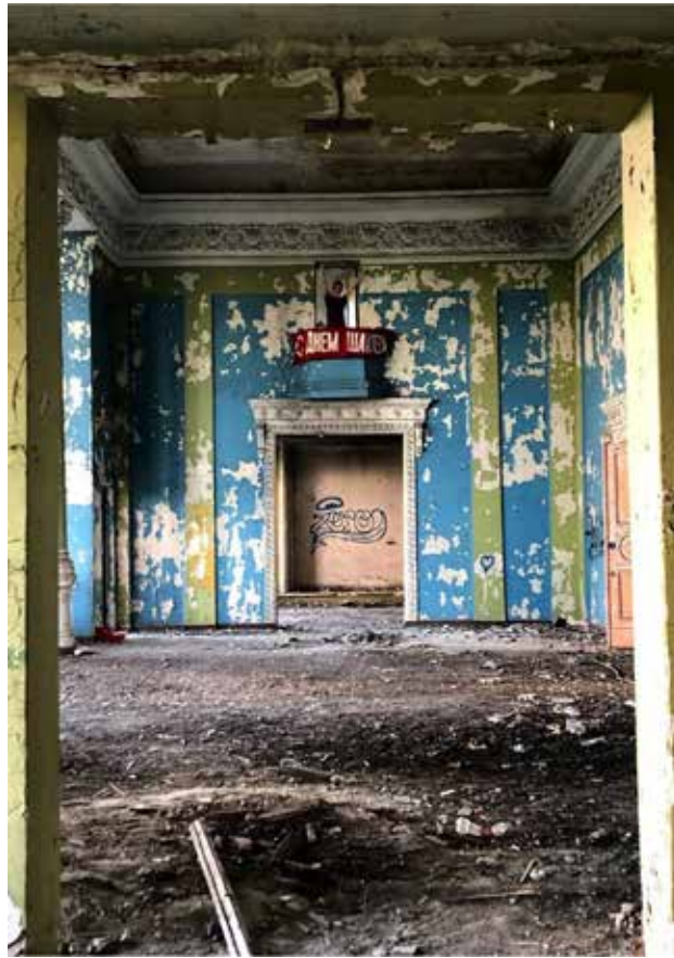
Figure 1. Novodruzhesk Palace of Culture.