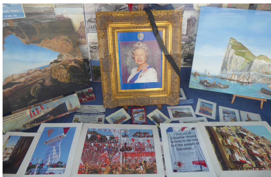
Fig. 1. Sculpture by Ambrose Avellano commemorating the 1967 referendum and materializing the votes cast. Fig. 2. Window display at Luis Photo; a portrait of the Queen, draped with a black ribbon to indicate mourning, takes centre stage in a display of photographs of previous National Day celebrations and depictions of the Rock iself.