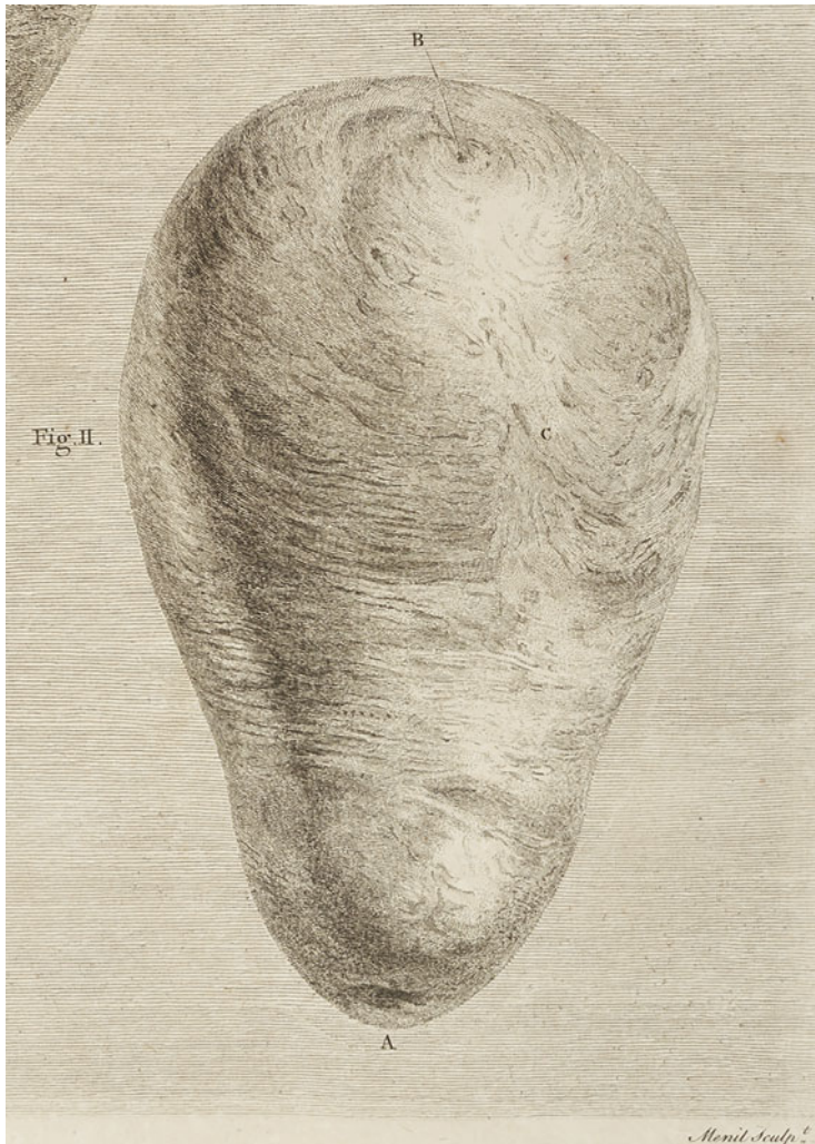
Figure 2. Hunter, op. cit., Plate XIV, Figure II. Caption reads, 'From a fourth subject, at nine months. This shews the disposition of the muscular fasciculi on the inside of the womb, in three different views.'