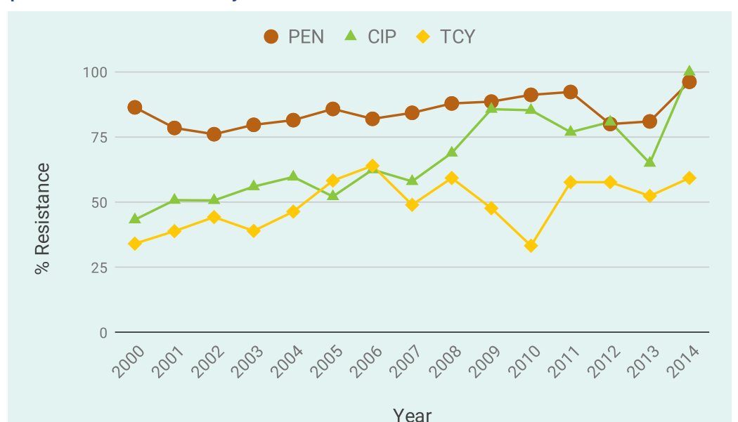
Fig. 1. Annual resistance rates of N. gonorrhoeae between 2000 and 2014 for penicillin (PEN), ciprofloxacin (CIP) and tetracycline (TCY)