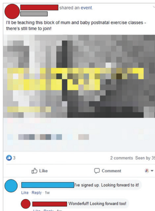
Figure 1: Sample (anonymized) interaction between a local business and a local parent taken from the ABC Lab Communities page

The second area of need was for pregnant women and parents of young infants. While the town benefited from a number of popular playgroups and activities for young children, these were less suited to smaller babies. The generally high level of noise, and fear of boisterous toddlers trampling on infants, put off parents of babies who were unable to sit unsupported or crawl. Additionally, local parents informed us