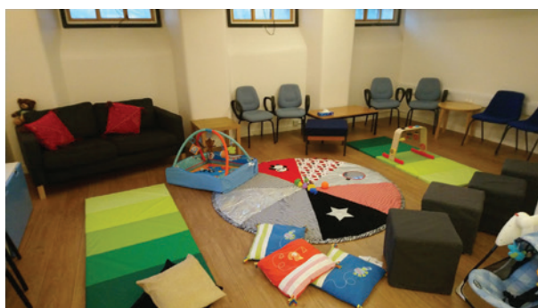
Figure 2: Set-up of lab space for the Baby Bee sessions

At a distance from the mats, tea, coffee and snacks (provided by the university) were available. At the beginning of each session, mothers entered the space, took any refreshments they wanted, and sat around the room. The first twenty minutes of every session were given to informal peer interaction. Members of the lab team who were themselves experienced mothers sat with the mothers in attendance, interacting