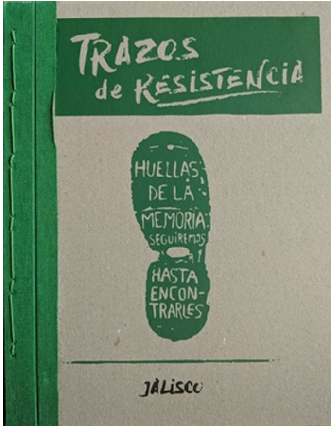
Figure 5. The cover reads: “Footprints of Memory: we will carry on until we find them”. [This figure appears in color in the online issue.]

Body” event in Liberation Square and Melchor Flores’s account in The Caravan of Solace . Such solidarity is enacted by the process of turning these texts into a book through cartonera practices. In line with Askins and Pain’s (2010) argument that materiality and craft play an important role in gluing together transient communities, La Rueda’s participative workshop practices enable ever-evolving, transient communities to unite—through physical acts like cutting, painting and stitching—into a unified social body. It is no surprise that this collaboration is accorded primacy of place by La Rueda as its ninth anniversary edition: “For us, even though Tambo, like so many others, is not with us physically, his spirit accompanies us in our day-to-day action. The memory of all of them carries on, and will carry on, uniting us” (Fong 2018, 7–8).