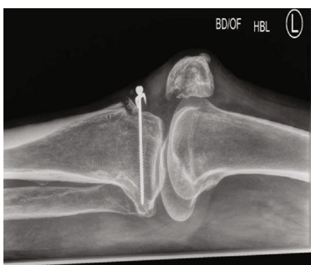
FIGURE 3: Lateral radiographs of the knee after the second injury with migration of the washer and failure of fixation.

with cancellous screws is effective. Fracture types that extend to the joint can be managed with percutaneous cannulated screw fixation [25–27].