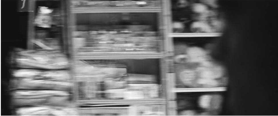
Figure 3. The superimposition of Costa's profile (far right), blending with the image of Cochabamba as he leaves in a taxi.