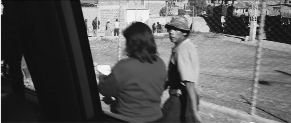
Figure 1. A point-of-view shot from the opening scene of También la lluvia . We do not see Sebastián, but instead what he sees – the surrounding Cochabamba.