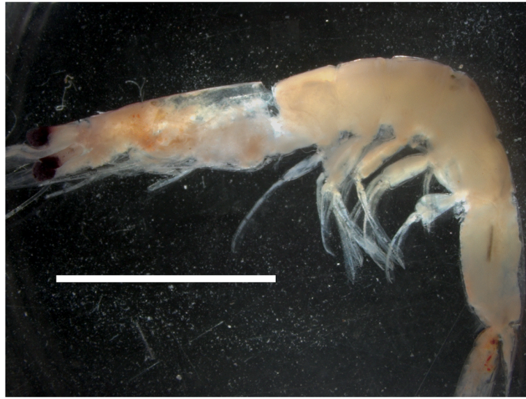
Fig. 3 Peisos petrunkevitchi collected from the stomach of a stranded humpback whale. The horizontal bar represents 1 cm.

The total length of the stranded animal (8.63 m) suggests that it was a juvenile, since this size corresponds to a one year old humpback whale (Clapham et al. 1999). Humpback whales at this age are usually approaching independence from their mother (Clapham et al. 1999) and this young animal could be starting to prey on crustacean after being recently weaned. The feeding may therefore have been opportunistic as a result of a large patch of prey being encountered. Also, large amounts of P. petrunkevitchi were found beached near the stranding site in the previous and following years ( personal observation A.S.F.) so it is likely that the shrimp was abundant in the area in the year of the stranding.