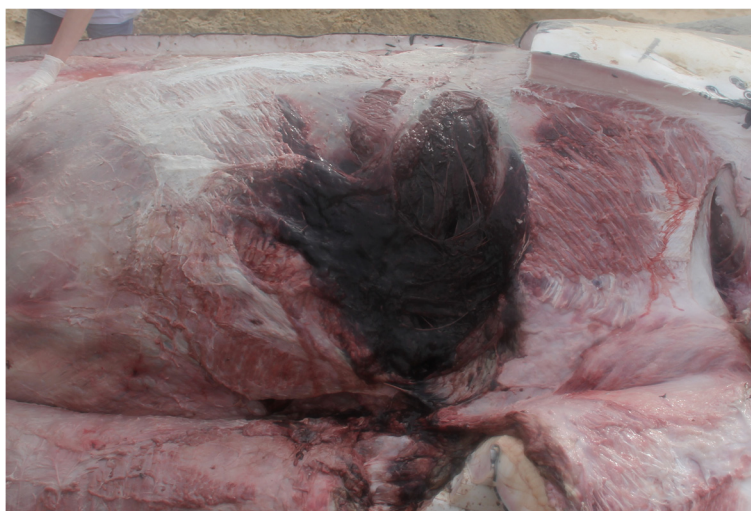
Fig. 2 Hematoma on the right side of a humpback whale carcass, in the thoracic/abdominal muscular layers. The whale carcass is facing right.