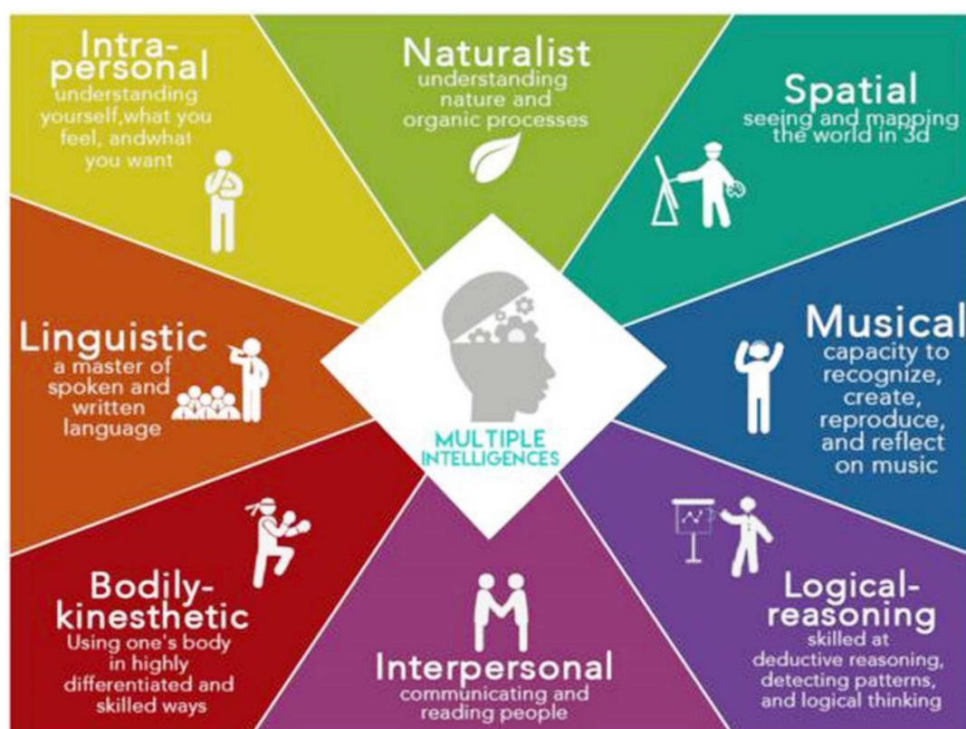
Figure 1. The multiple intelligence model developed by Gardner [16].

The competency frameworks suggested in this paper and elsewhere offer a route to assess ESD outputs. However, ESD is ultimately about facilitating transformative learning so that people can act sustainably. There are various possible approaches to enact ESD. We propose that the multiple intelligences concept offers a mechanism for learners to enact the competencies gained through ESD. The multiple intelligences proposed by Howard Gardner [16] represent a sum total of human capacities to influence, interact with, and communicate with our world. This includes both human and non-human life forms. The seven intelligences are represented in Figure 1.