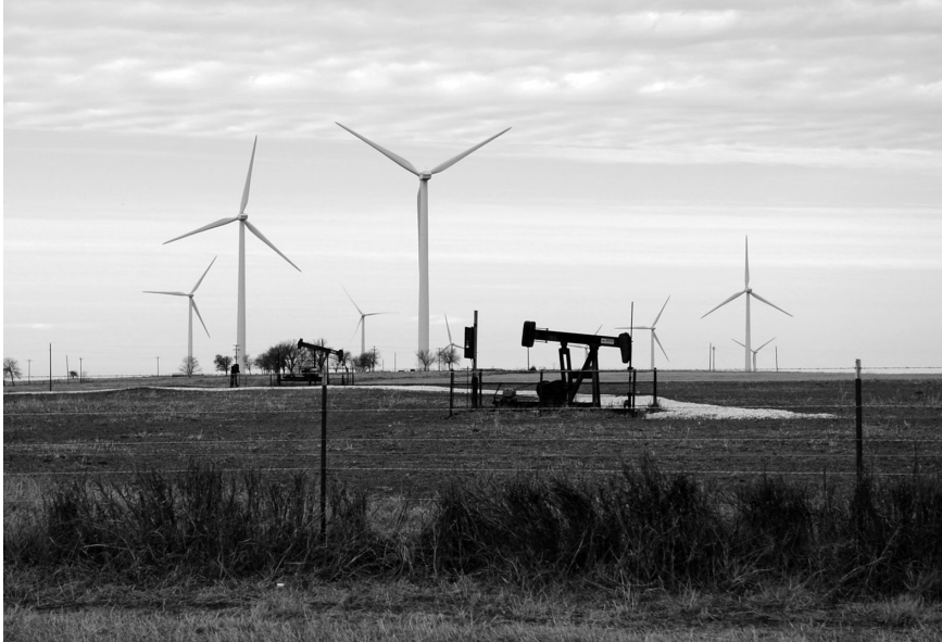
Figure 1. Energy generation from wind and oil coexists side-by-side in many places in the United States, as here in Texas.

accordance and other times at odds, demonstrating why it is important to think of energy ethics in much more capacious ways. These ethical worlds present a plurality and complexity, idiosyncrasy if not inconsistency that current scholarship is poorly positioned to grasp.