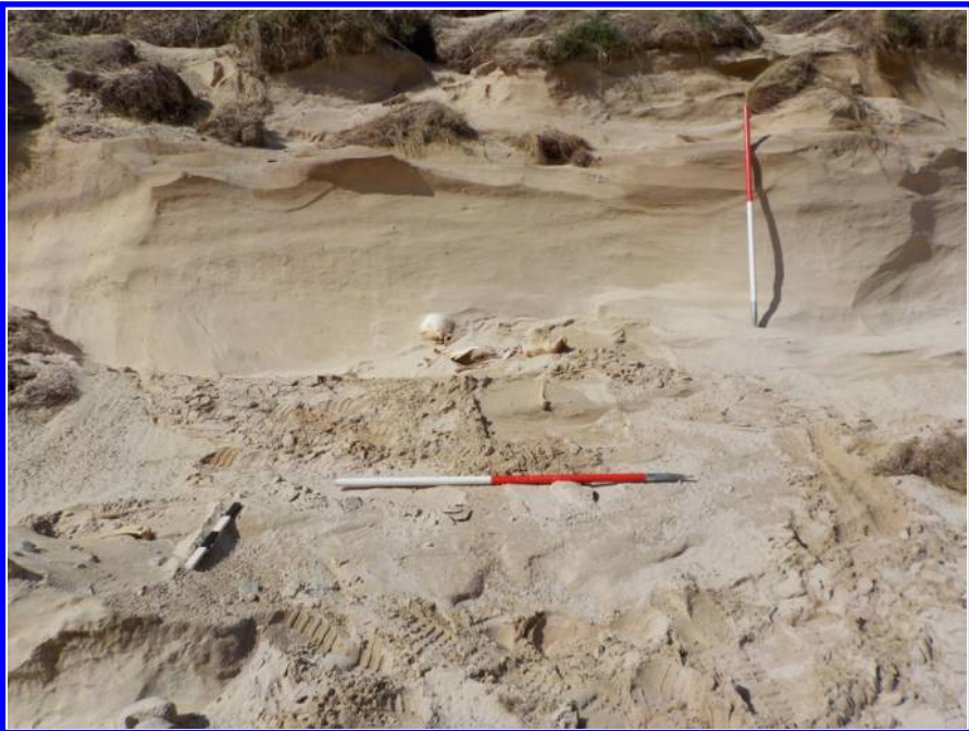
Fig 3 Inhumation and old ground surfaces [003] and [005] above