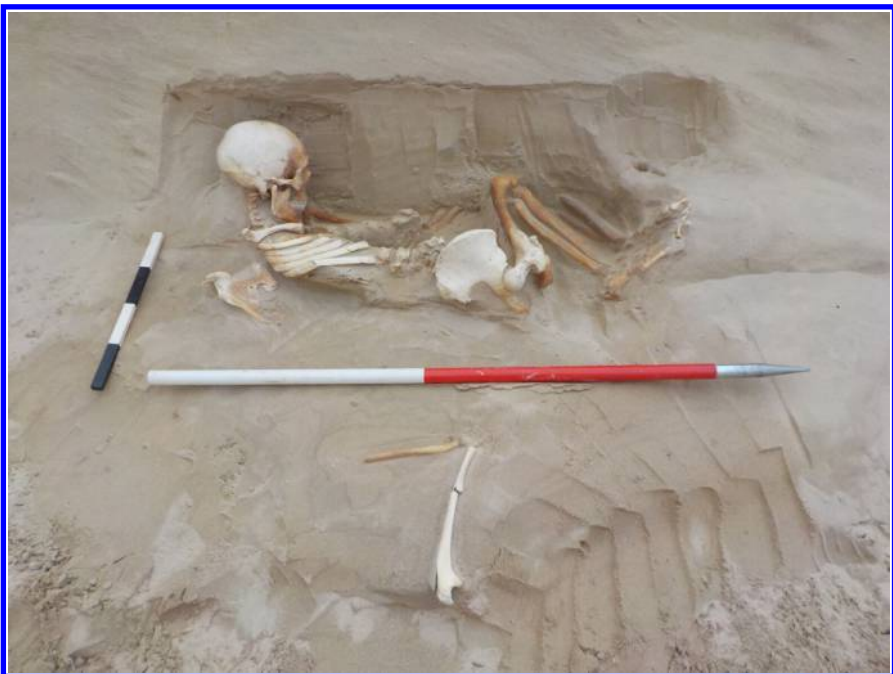
Fig 5 Excavated skeleton [008]

for photographic recording due to the significant depth of dune sand covering the left arm and knee. These parts were only exposed prior to lifting to minimise the possibility of collapse. Two former soil horizons [003] and [005], that post-date the burial, were noted on the side of the erosion gully at depths of 1.4m and 3.0m. There was no visible sign of a grave cut above or around the skeleton, most likely due to the sterile nature of the dune sand into which it had been interred.