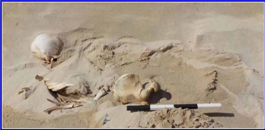
Fig 4 Nature of exposure of inhumation upon arrival at site