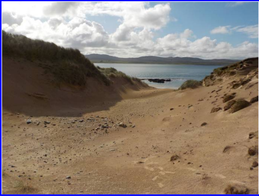
Fig 2 Erosion gully with shell midden at base