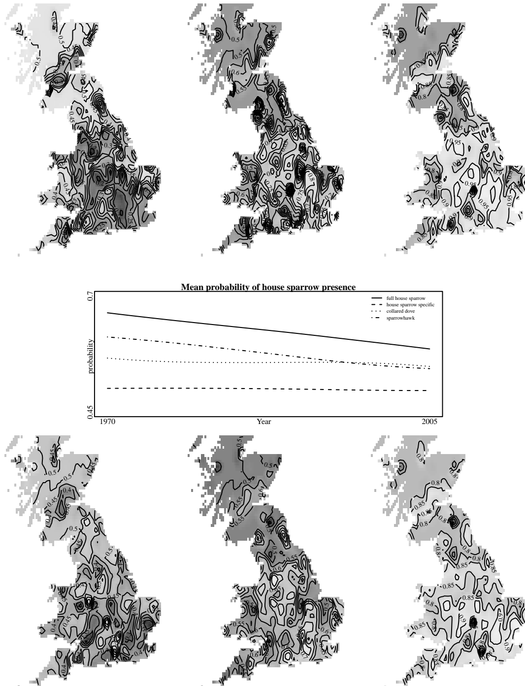
Fig. 1: Top row from left to right shows the estimated probability of presence of sparrowhawks, collared doves, and house sparrows in 1970; the bottom row shows these probabilities for 2005. The central panel shows the mean contribution of each species specific random effect to the probability of observing house sparrows over the time period. The solid line is the average value in each year of the probability of observing a house sparrow. The dotted line indicates the average contribution of the process governing the probability of presence of collared doves to the probability of presence of house sparrows. The dot-dash line indicates the average contribution of the process governing the probability of presence of sparrowhawks to the probability of presence of house sparrows. The dashed line indicates the average of the house sparrow specific random effect in each year.