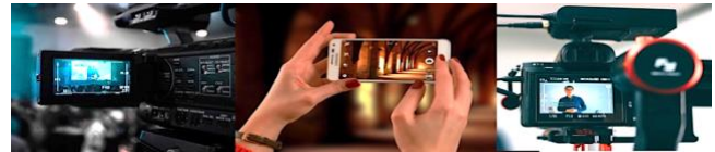
Figure 2: HCI Educators’ workshop #HCIED2018 http://alandix.com/hcied2018/

with practical tips in using video in HCI education with a focus on assessment and feedback, followed by a consolidation session in which participants summarise their recommendations. These resources will be made available to the wider community after the event (see Section 3).