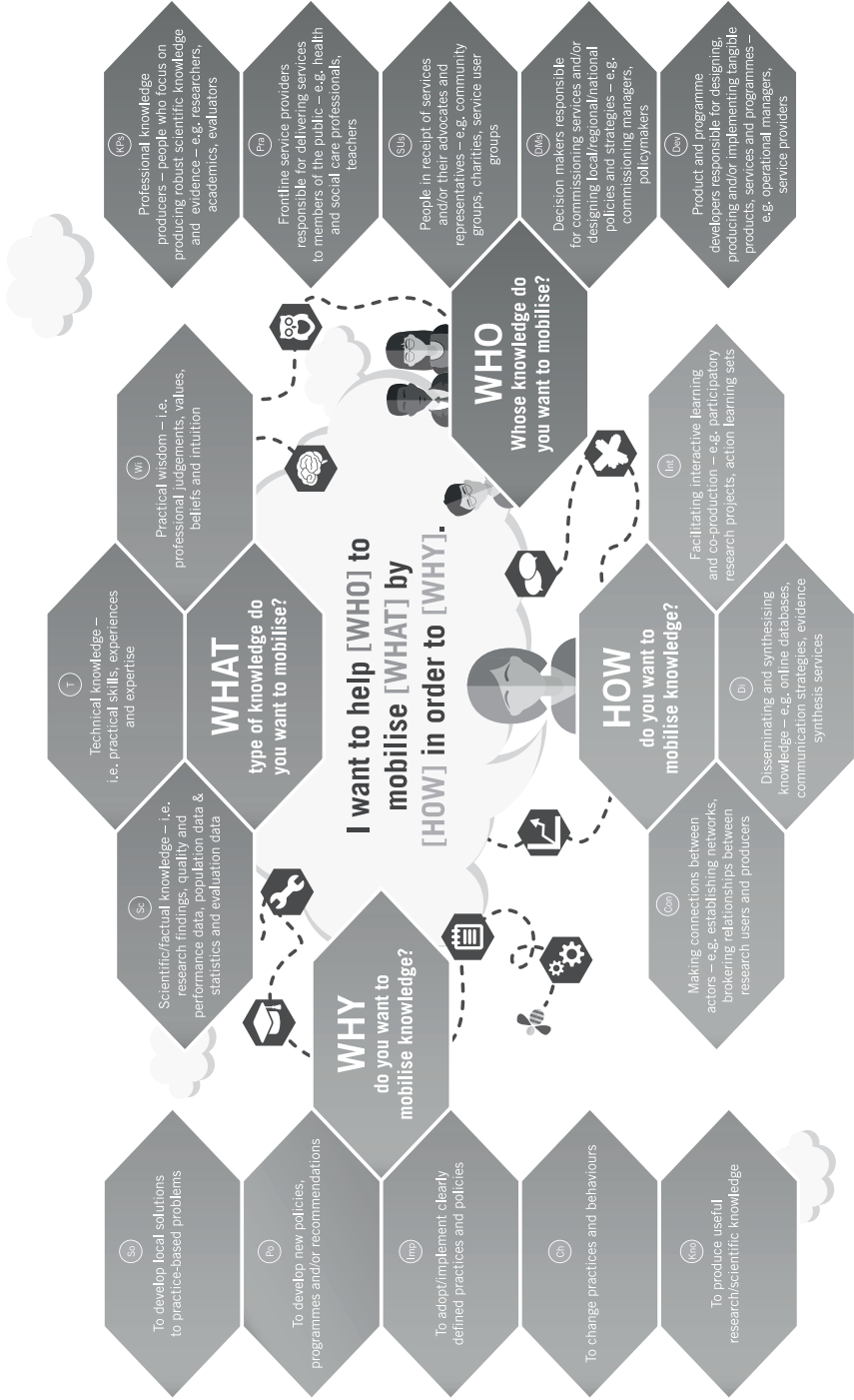
Figure 2: Why, whose, what, how framework for knowledge mobilisers