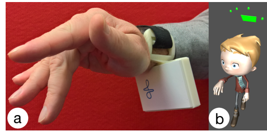
Figure 4: a) A wrist-worn Soli sensor provides precise control for aspects of a virtual puppet (b).

The second application controls a virtual puppet (fig. 4b). As in the first example, the head-mounted Leap provides coarse control of the puppet's pose. However, in this case, microgestures are used