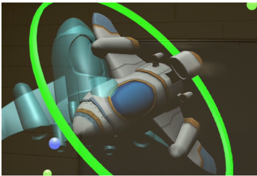
Figure 3: Spaceship docking application as viewed through the HoloLens AR display.

virtual objects, while microgestures allow fine precision of object placement. Overall, we focus on allowing precise interaction and reducing fatigue, with smooth transitions between macro and micro gesture scales.