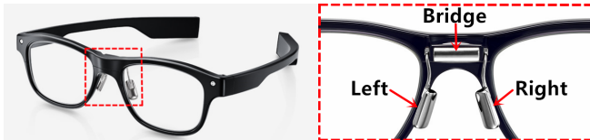
Figure 2: J!ns Meme and its EOG electrode placement.

In terms of nose interaction, people occasionally use their nose to tap the screen of a phone (e.g., to replace finger or stylus), especially when the hand is covered with a glove (during winter) or the phone is too big for one-handed usage and the non-supporting hand is occupied. The Wall Street Journal [19] reports that people also use their nose to interact with smartwatches when their hands are occupied. Most related work focuses on this idea of using the nose to interact with a touchscreen, while our work focuses on detecting the finger gesturing on the nose itself. Snout [20] explores one-handed use of touch devices using the nose, and Nose-Tapping [16] presents an in-depth user study, identifying the main challenges and contributing to the design principles for nose-based interaction.