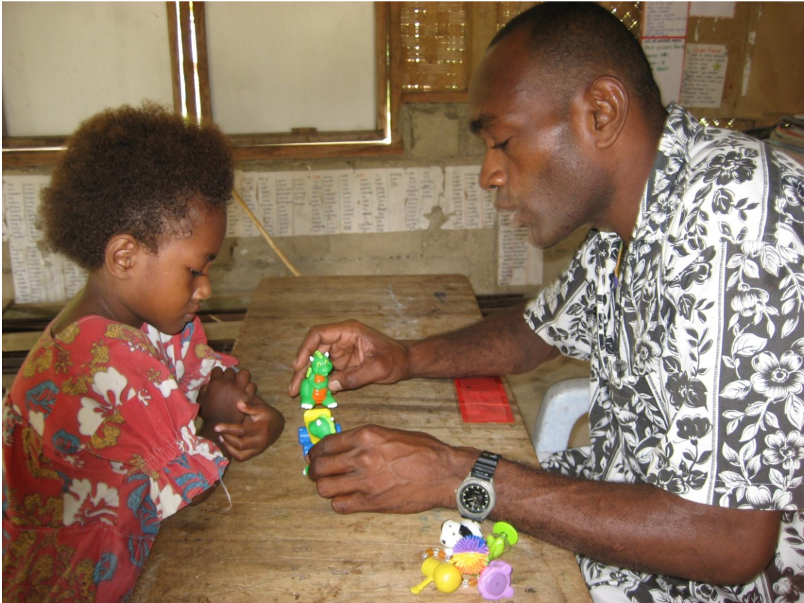
Figure 1: Five-year-old being tested on the island of Motalava, Vanuatu.

All testing sessions were videotaped using a small Canon digital camera for later analysis and reliability assessment. The camera rested on a tripod three to five meters away and provided an overhead side view of child and experimenter, who faced each other at a table across a distance of one to two meters (see Figure 1).