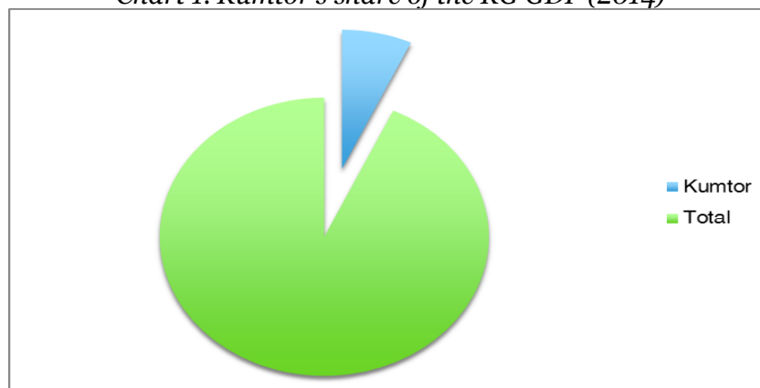
Chart 1. Kumtor's share of the KG GDP (2014)