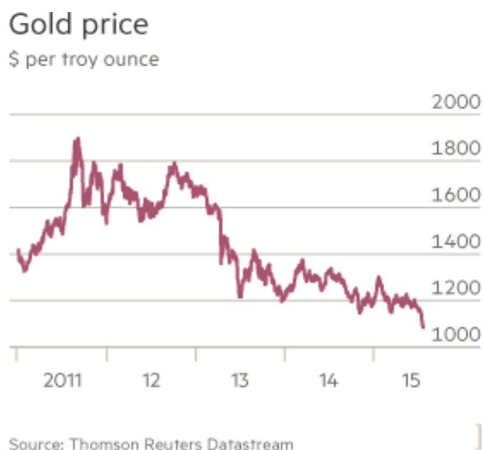
Chart 4. Rise and drop in gold prices