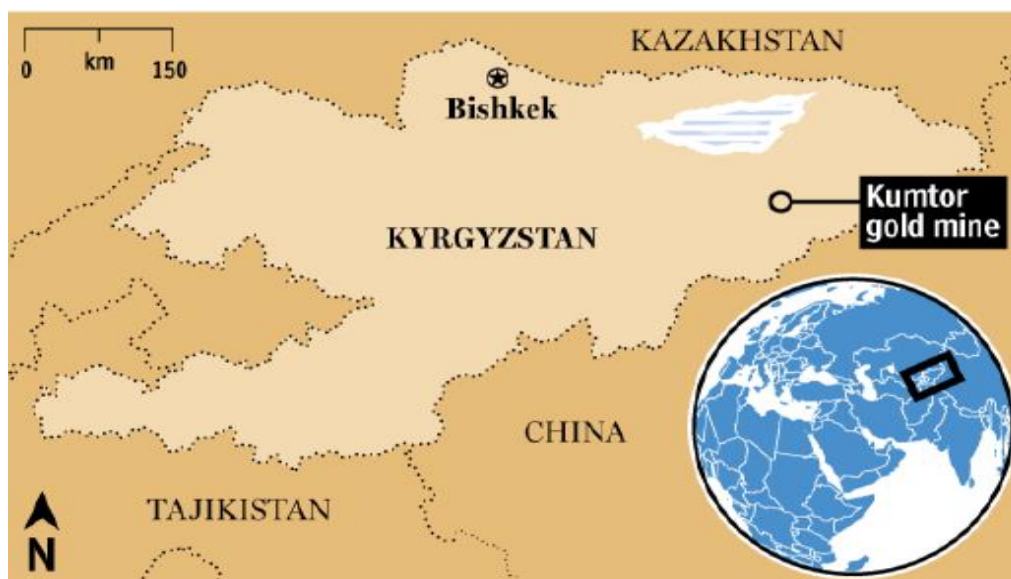
Map 1. Kumtor

Kumtor (map 1) is the largest gold mine in Central Asia operated by a Western company. The gold deposit was discovered in 1978, but due to the difficult environmental conditions and the costs associated with developing the mine the project was suspended. Development started again in 1992 and in 1997 the mine became operational. Production is expected to last until 2026, when most of the reserves are expected to be exhausted.