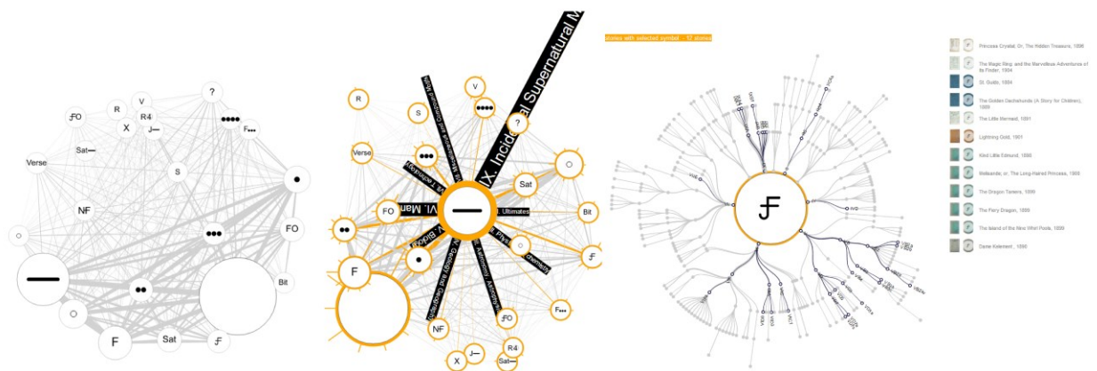
Figure 3: Early visual speculations leading up to the W@nderverse

our collaborative “prototyping” process, which profoundly altered our research questions and intentions as well as our perspectives on the collection and our respective disciplines—literary studies and InfoVis. The W@nderverse is therefore both the mediator and manifestation of our exploratory and interdisciplinary research process. Our many design detours (necessitated by ongoing archival discoveries and visualization experiments, see Fig. 3), show what is now largely invisible yet fundamental to the W@nderverse: our research thinking through visualization , an approach that has its parallel in HCI with “research through design” (Zimmerman, 2007).