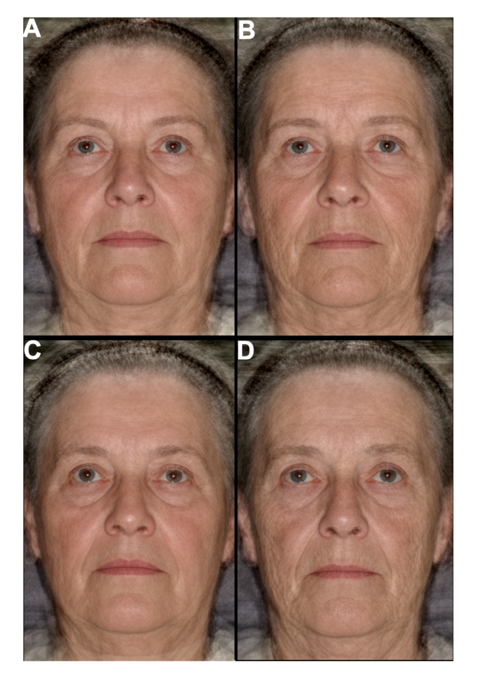
Figure 1. Composite images representing the effects of environmental factors on variation in perceived age between monozygotic twin sisters (upper images) and the effects of environmental and genetic factors on variation in perceived age between dizygotic twin sisters (lower images). a, Younger looking and b, older looking monozygotic twin sister composites (mean perceived age 64 [57–70] and 70 [60–85] respectively). c, Younger looking and d, older looking dizygotic twin sister composites (mean perceived age 64 [59–74] and 76 [69–84]). The older looking twin sister composites demonstrate signs of increased skin wrinkling, increased nasolabial fold shadowing (running from the lateral edge of the nose to the outer edge of the mouth) and, particularly for the non-identical twin comparison, a grayer skin color, a thinner face and reduced lip fullness. Each composite respectively; square brackets denote age ranges. doi:10.1371/journal.pone.0008021.g001

Hence, although sun-exposure causes an increase in the number of pigmented spots, it does so differentially depending on the skin type of the individual, which also determines whether they present alongside other signs of sun-damage such as skin wrinkling.