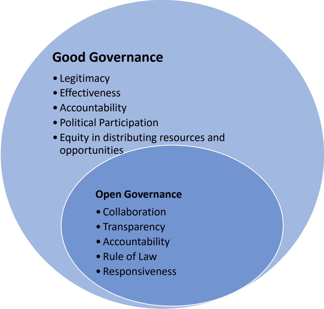
Figure 1: Intersection between good governance and open governance