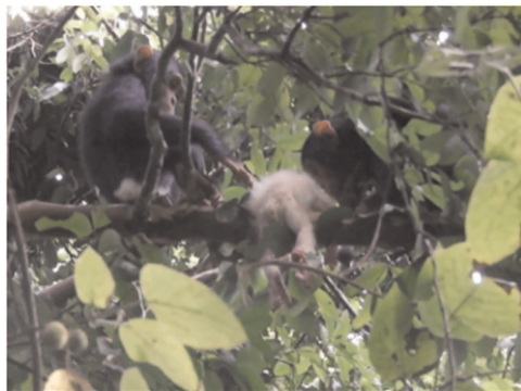
FIGURE 1 The dead body of the infant with albinism inspected by two infants, MZ and OZ, stroking its back and sniffing it, respectively.

At 7:54 a.m., FK approached the carcass again, picked it up, and moved 4 m away holding it by the foot. He bit part of the palm of the right hand of the carcass and immediately spat it out. MZ and OZ again approached the carcass to sniff it. At 8:09 a.m., FK placed the carcass in a tree branch and after grooming its back, moved around 7 m away to rest. At 8:25 a.m., ZL approached the dead infant, sniffed it, touched its penis and anus. ZL then inserted a digit into the anus of the carcass, moving the digit in and out before sniffing it. After 10 min of repeated manipulations and inspections of the corpse, ZL moved away. At 8:36 a.m., ST approached the carcass and inspected it by sniffing and touching it. ST was joined by KZ who also inspected the carcass. Both ST and KZ inspected, sniffed, manipulated, touched, and groomed the carcass repeatedly for 8 min. Notably, at 8:42 a.m., KZ pinched some hair on the right arm of the carcass with his lips before doing the same on his own body. At 8:44 a.m.,