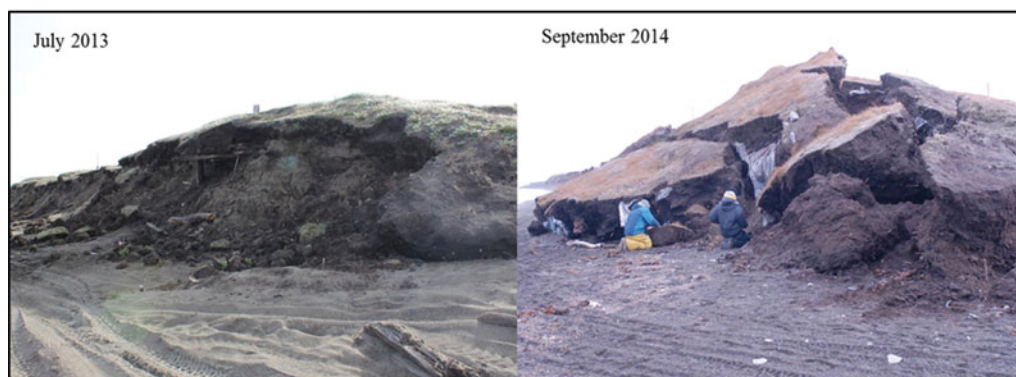
Figure 3. Examples from Walakpa in Alaska of newly exposed archaeological layers that are quickly degrading due to multiple processes (permafrost thaw, frost/thaw processes, microbial degradation and wave action during storms).