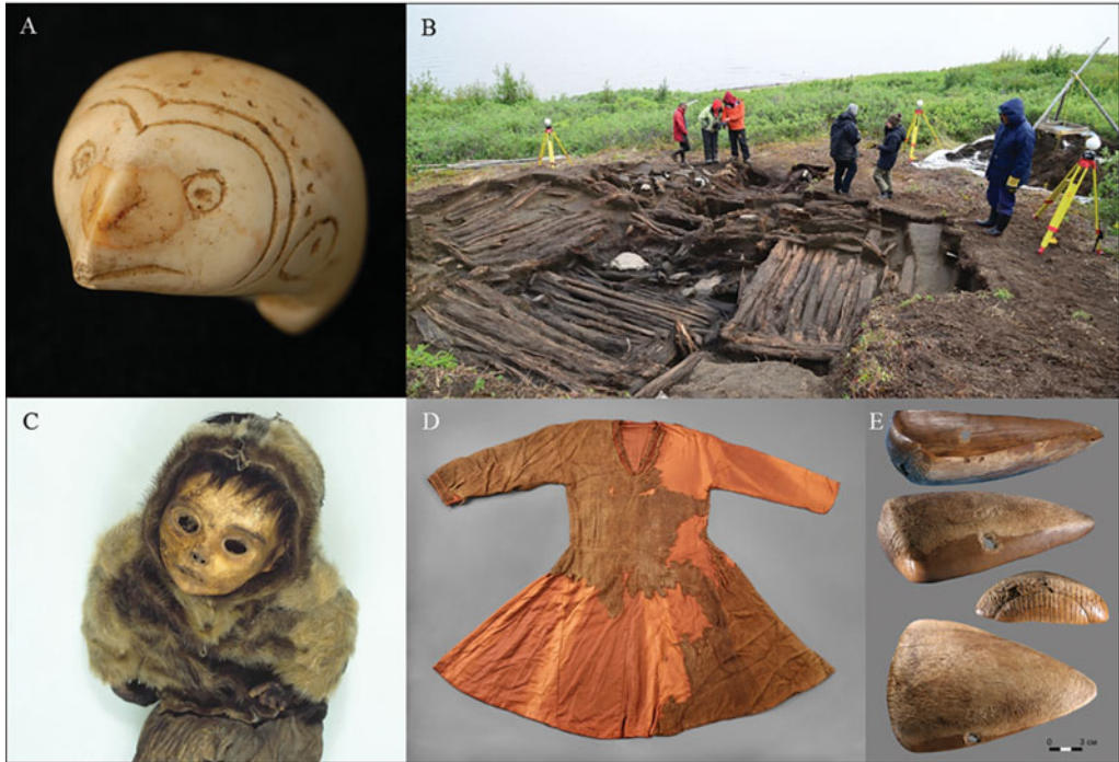
Figure 2. Examples of some of the extraordinary archaeological finds from the Arctic: A) ivory owl effigy toggle from Nuvuk, Alaska; B) pre-contact driftwood house floor from Kuukpak in the Mackenzie Delta, Canada; C) human remains from Qilakitsoq, Greenland; D) preserved medieval textiles from Andøy, Nordland, Norway; E) 31 000-year-old decorated ivory scoop from the Yana site, Arctic Siberia.